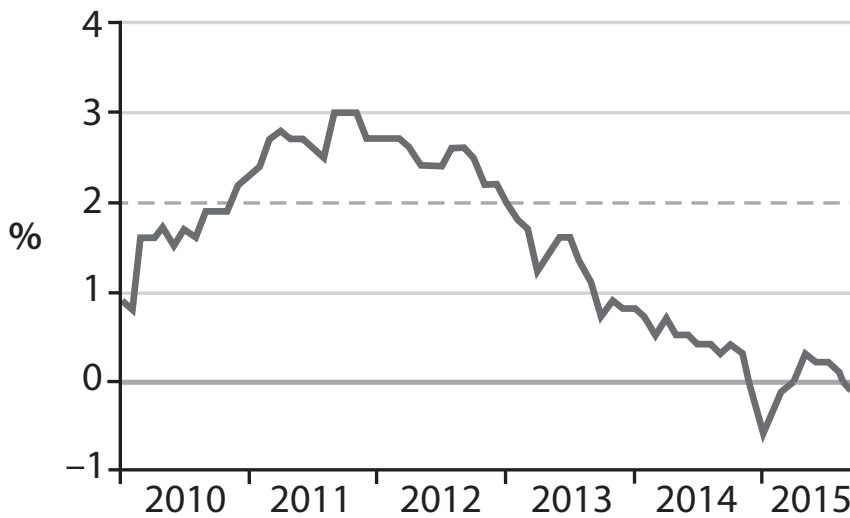
Figure 1 Eurozone CPI rate of inflation, 2010 to 2015